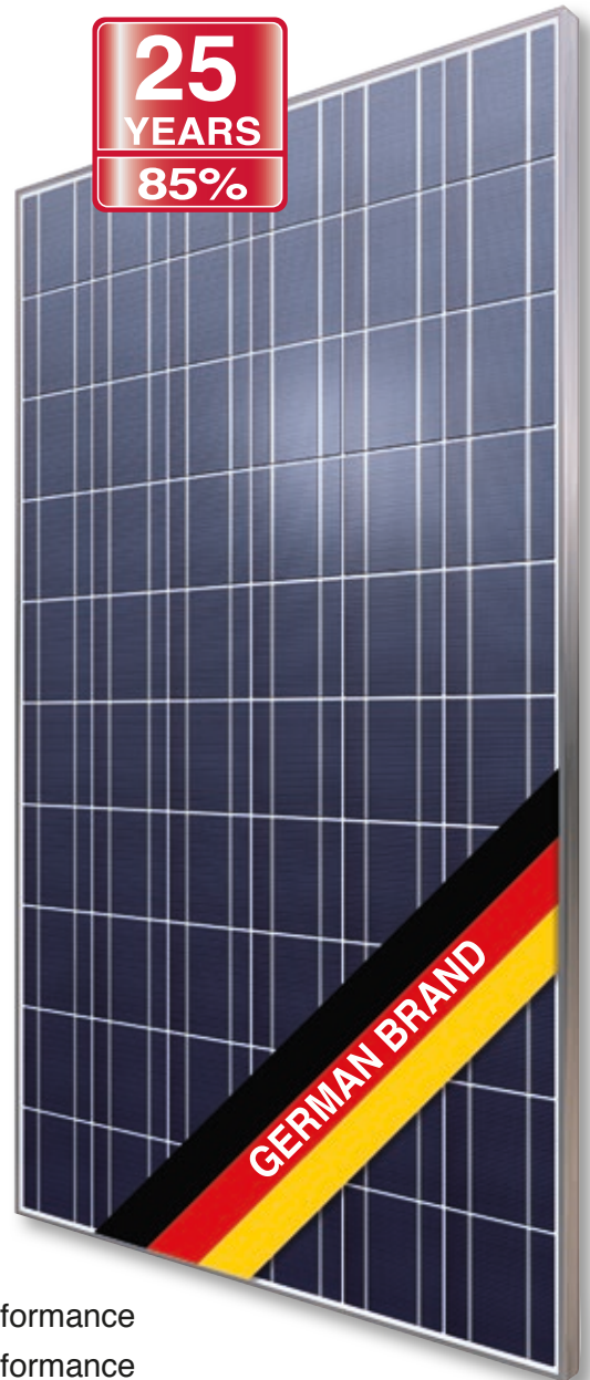
Fig. similar 60P156EN180321A

Exclusive linear AXITEC high performance guarantee!